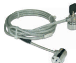
Shintaro Cable Lock with Key