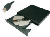
Aspire One External USB Optical Drive