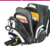
Slam Back Carry Bag